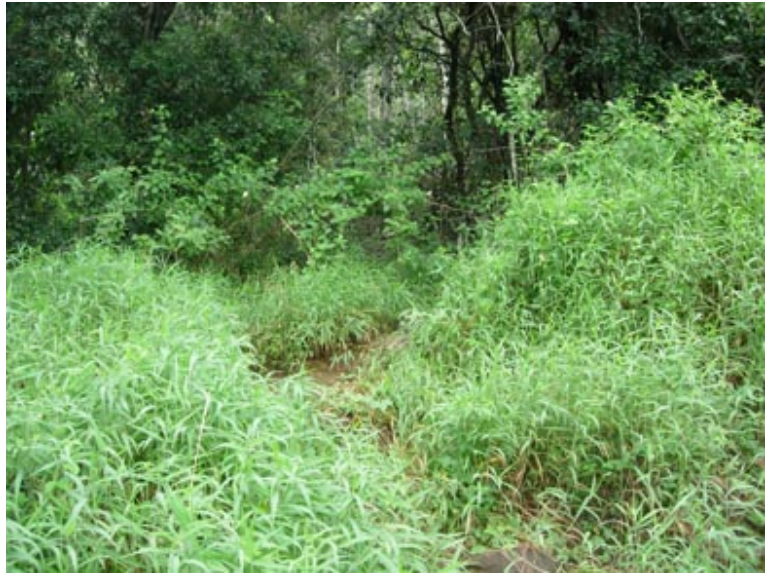
and passes under the trees