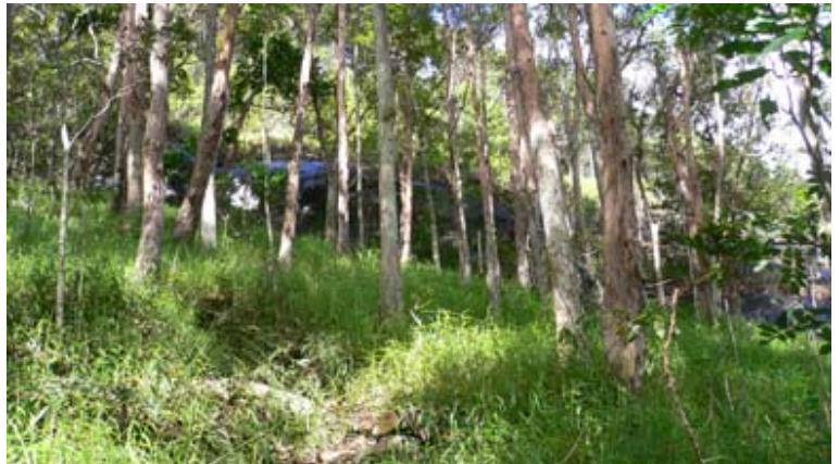
below: passing left of the large rock slab