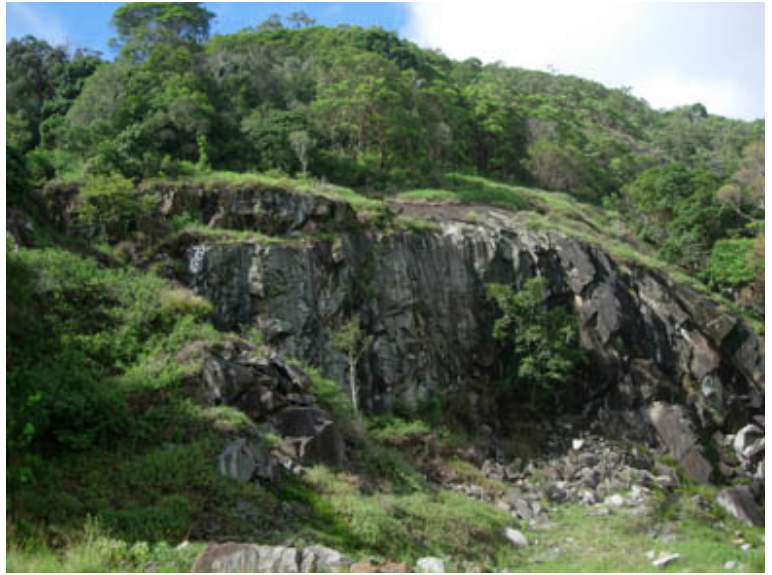
passes under the quarry