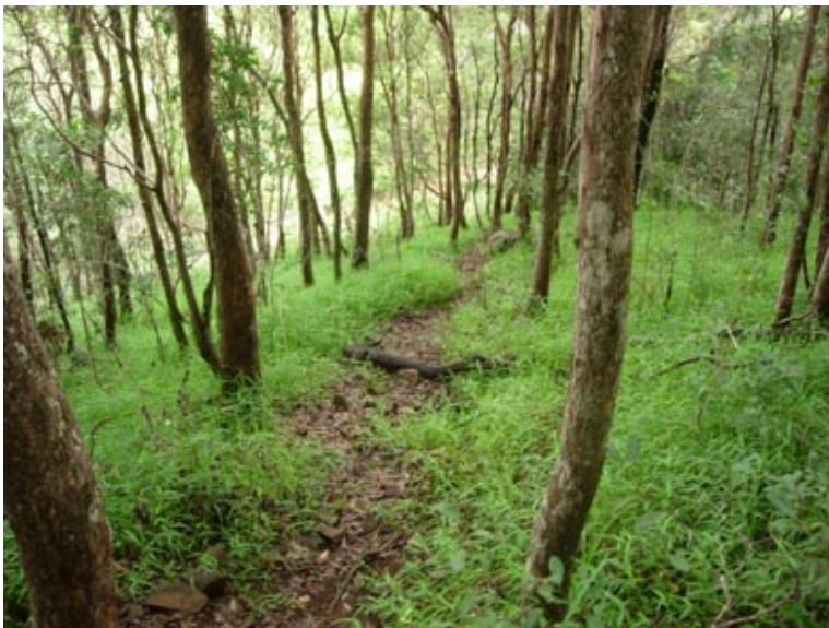
left: looking downhill from 50 metres in