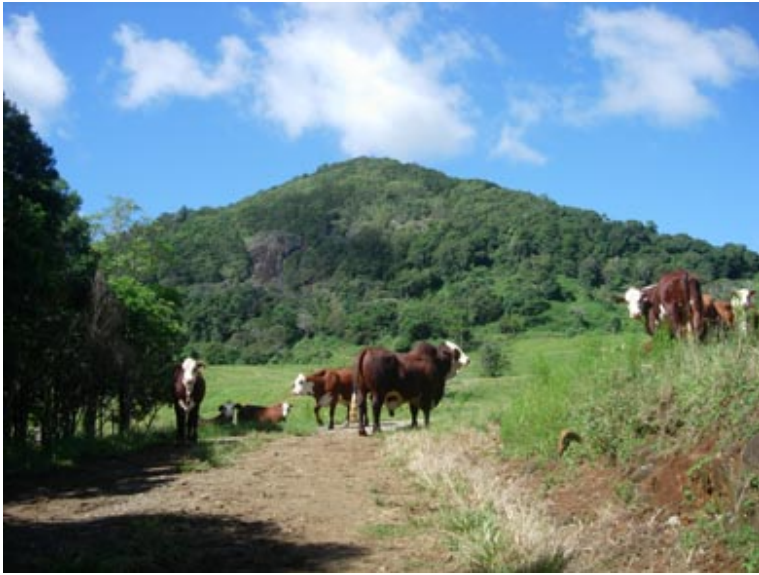
the 4wd track goes left under the mountain