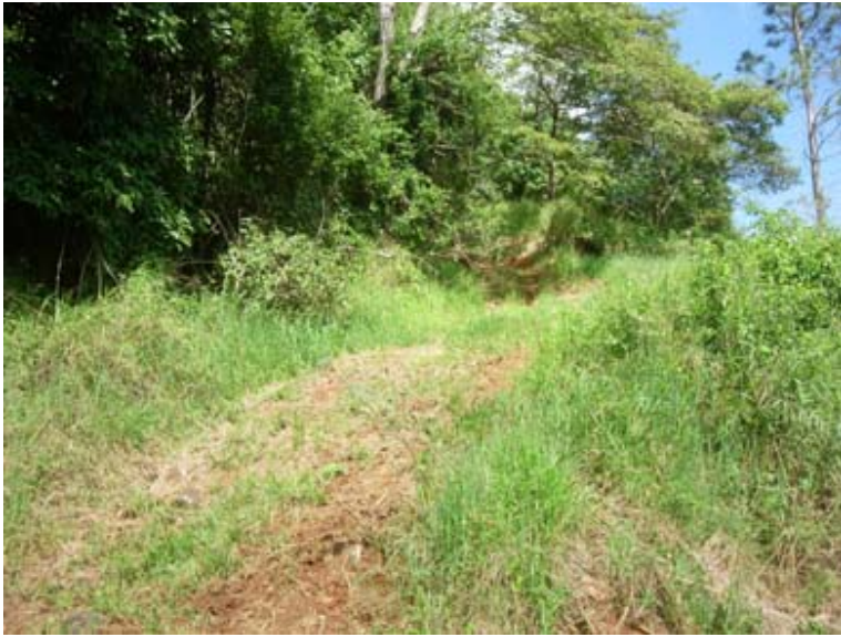
turns steeply up the hill