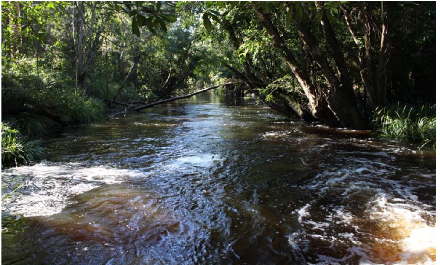
below: Six Mile Creek from below the dam overflow