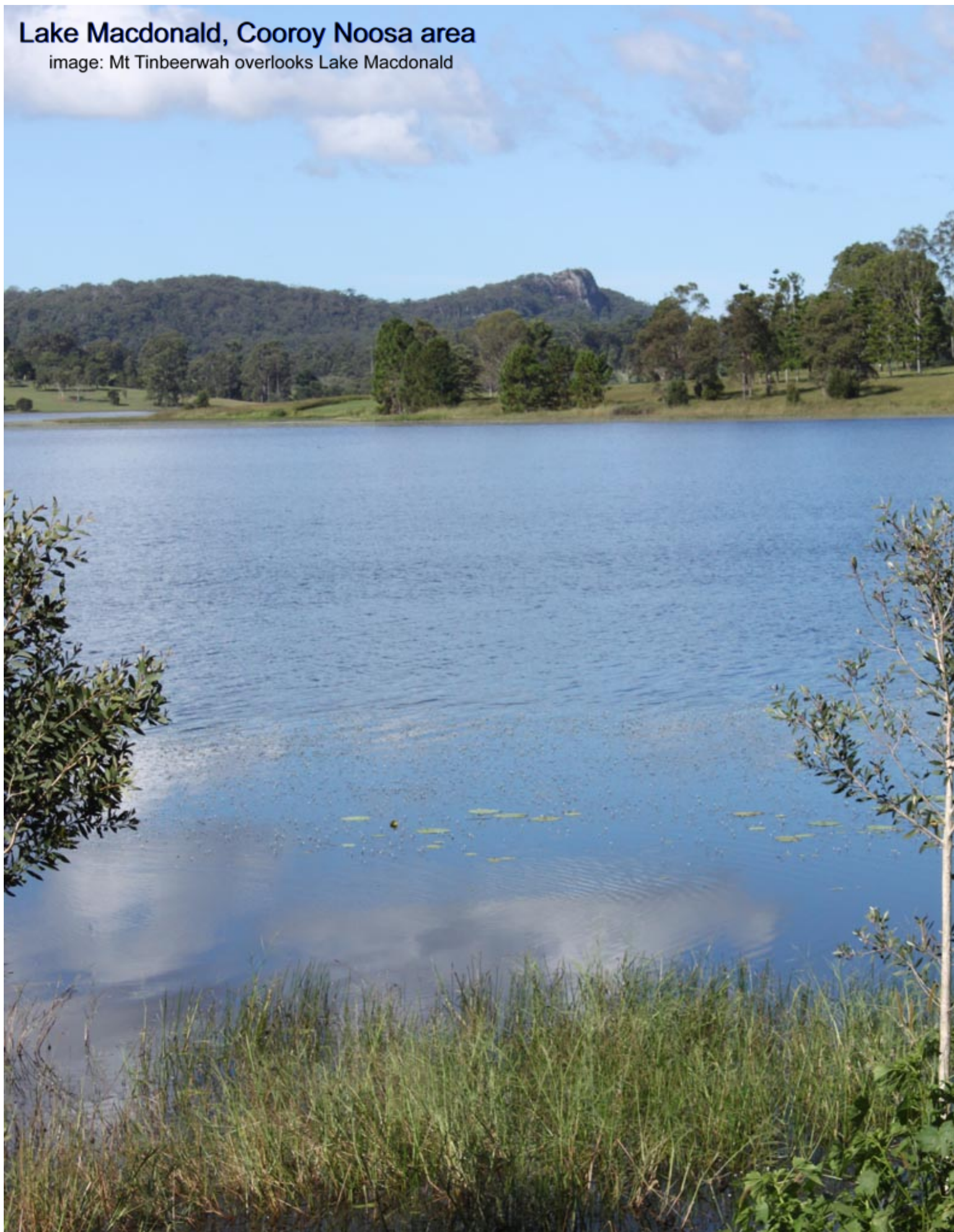
image: Mt Tinbeerwah overlooks Lake Macdonald