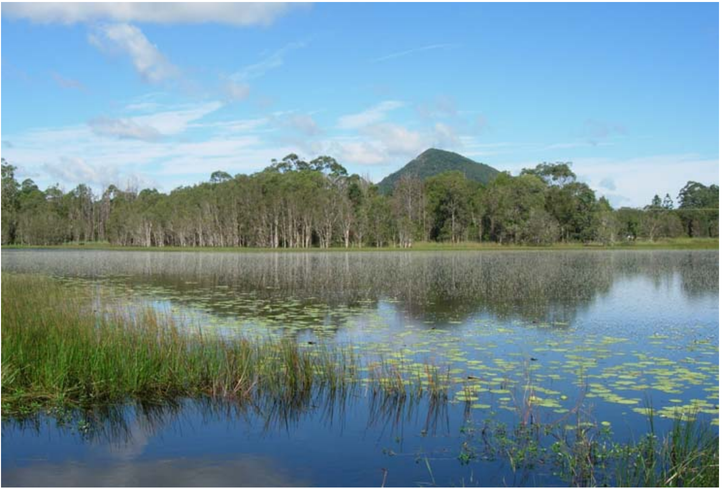
above: Mt Cooroy from near the bird hide, Jabiru Park