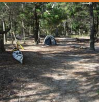
campsite under the trees next to the water point