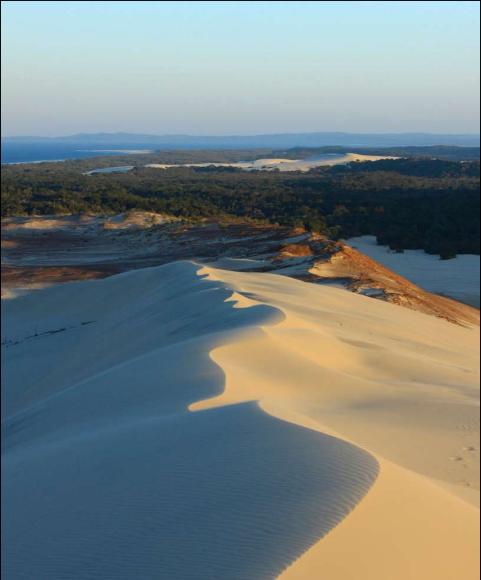
Big Sandhills Moreton Is.