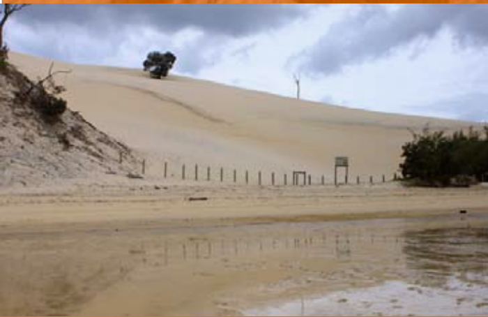
slide down the steep dune face or look for wind sculptures in the sand

Camping sites are north and south of the water point, under the trees, with views across the water. The Big Sandhills almost reach from coast to coast across the island. There is a walking track that makes it possible to walk west to east, but although it is shown on some National Parks maps, it is not signposted at either end, nor is it easy to find.