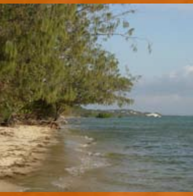
high tide blocks travel. Little Sandhills - 3 kms